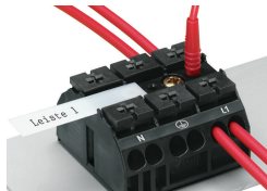
Testing with a 2 mm Ø test plug (max. 42 V).