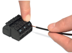
Inserting a conductor via push-button.