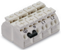
Commoning using a comb-style jumper bar (862-482).