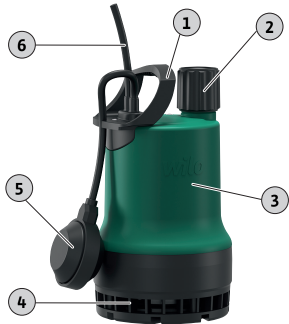
Fig. 1: Overview

Submersible pump for stationary and portable wet well installation. Pump with fitted float switch for fully automatic operation.