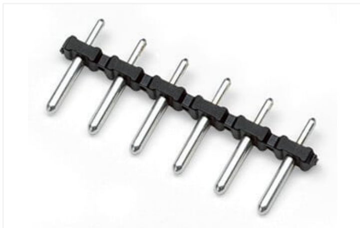
Color: ■ black