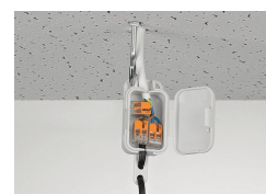
Pendant light connection in a suspended ceiling