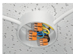
Lighting distribution in a ceiling canopy