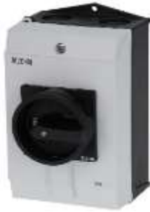
P1 Switch Disconnecter with I2 Enclosure and Auxiliary Block