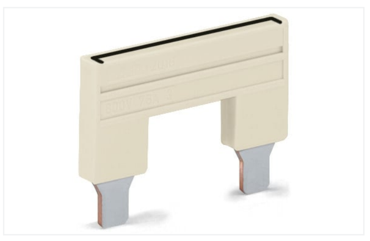
Color: ■ light gray Similar to illustration