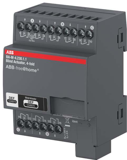
ABB Eco Solutions™

ABB-free@home® Blind Actuators for controlling up to 8 independent blind or roller shutter drives. The bus can be connected via enclosed terminal block.