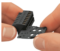
Strain relief plate for field assembly