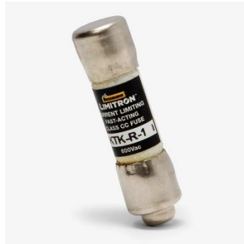
KTK-R Fuse (0.1-12A)