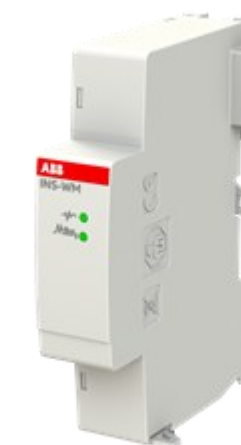
ABB Eco Solutions™

The INS-WM is a wireless M-Bus communication module for the InSite system, enabling the integration of up to 32 wireless M-Bus meters into the SCU200 control unit. Acting as a wireless gateway, it allows meter data to be collected and managed directly through the InSite webserver. The module features tool-free plug-in installation and is automatically detected and configured by the system, simplifying commissioning. Integrated status LEDs provide immediate visual feedback, while the external antenna connection ensures reliable wireless communication across different installation environments.