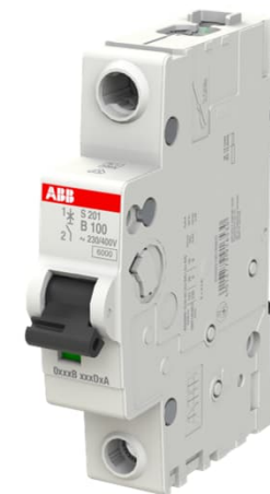
ABB Eco Solutions™

The S200 range is designed to protect installations from overloads and short circuits, ensuring reliability and safety under all operating conditions