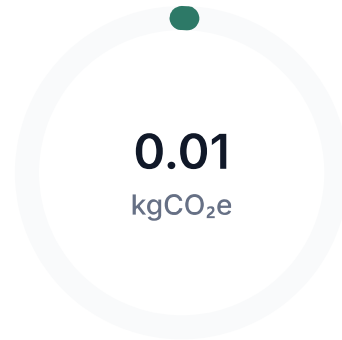
Transport < 1.00%