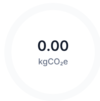
Production processes 0.00%