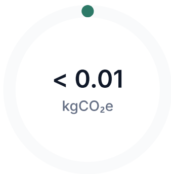
< 0.01 kgCO 2 e Waste < 1.00%