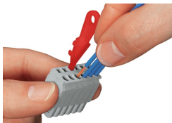
Conductor termination parallel to CAGE CLAMP® actuation