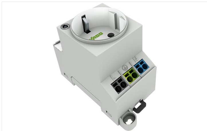
Color: ■ light gray