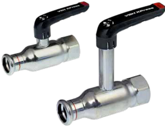
Apollo XPress FullFlow carbon ball valve (press x female thread)