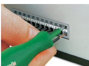
Feedthrough PCB terminal strips – front-entry conductor termination