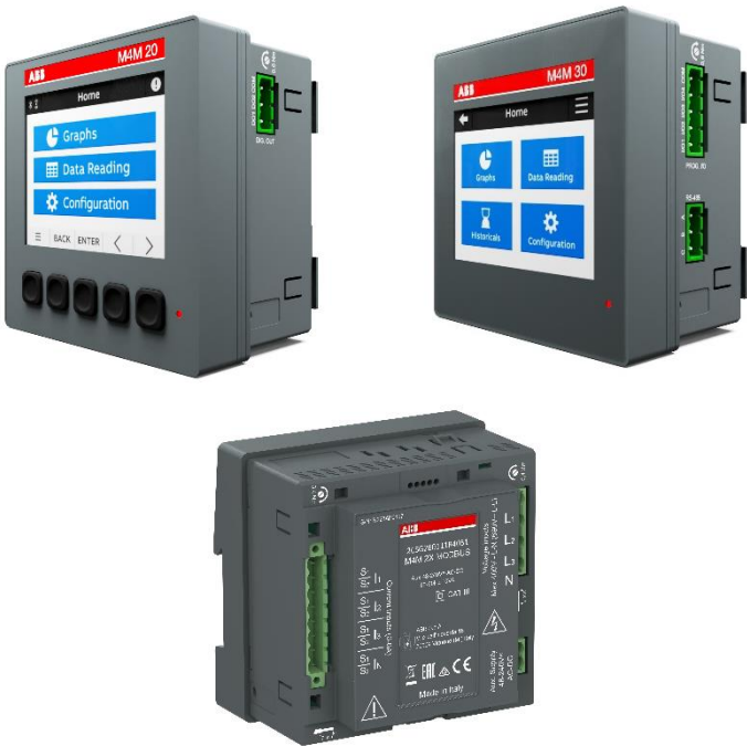
ABB Eco Solutions™

As a part of the power meter portfolio, M4M 20-30-2X range guarantees complete power quality analysis and accurate energy efficiency monitoring of all the energy assets: industrial and commercial buildings, facilities, data centers.