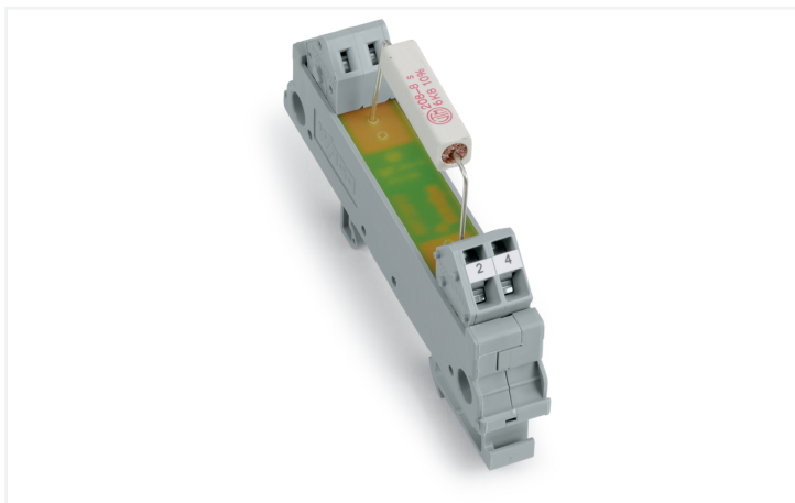
Similar to illustration Picture shows 289-128/003-000