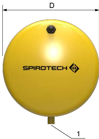
EVN 4 .. EVN 100, EVN 140