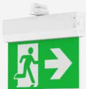
Track mounting 600-022 + 169-037