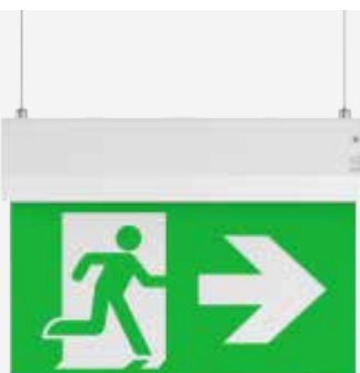
Pendant mounting 600-022 + 600-031