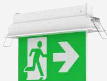
Recessed mounting 600-022 + 600-030