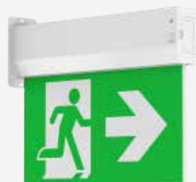
Side mounting 600-022