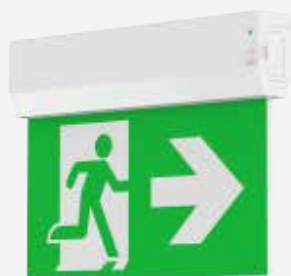
Ceiling / Wall mounting 600-022