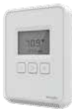
LCD with Buttons