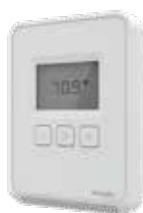
LCD with Buttons