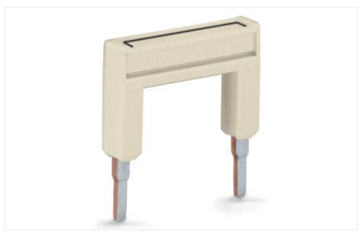
Color: ■ light gray Similar to illustration