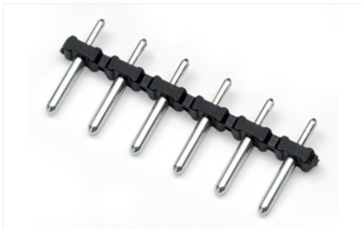
Color: ■ black