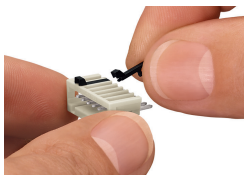
Coding a male header – fitting coding key(s).