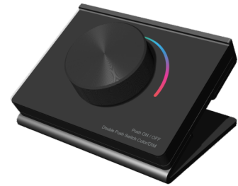
213-134 1 Zone RGB