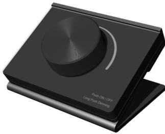
213-132 1 Zone Dimming