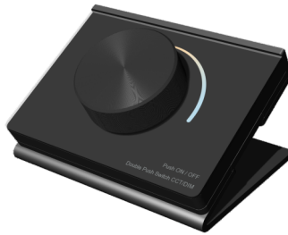
213-133 1 Zone CCT