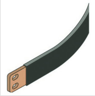
Omschrijving Bandella flessibile Nominale stroom 400 A