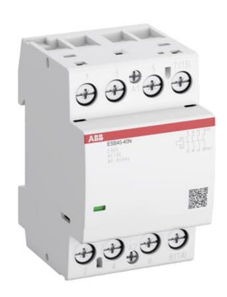
ABB Installation Contactor ESB40..N/EN40..N/ESB63..N