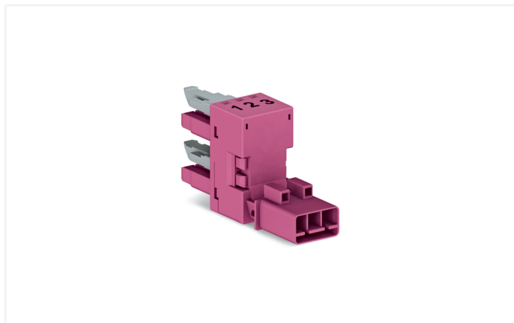
Color: ■ pink