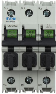
CCP2 Fusible Disconnect Switch