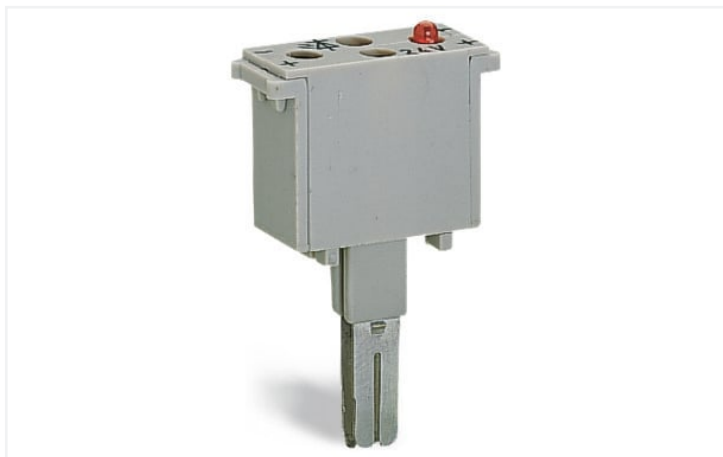
Color: ■ gray