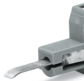
Contact type A: Testing only when unwired.