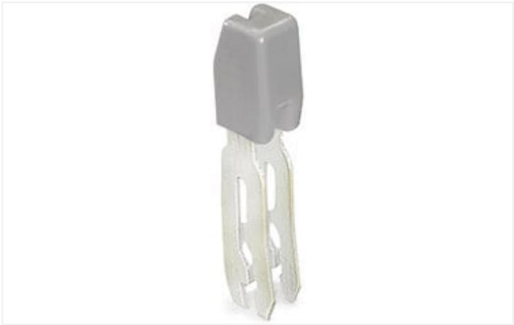
Color: ■ gray Similar to illustration