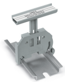
Group marker carrier (2009-163) for marking strips (2009-110)