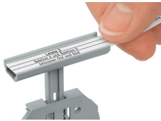
Group marker carrier (2009-163) for marking strips (2009-110)