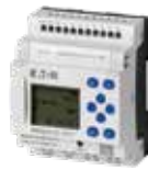
Eaton easyE4 control relay (with embedded web server)