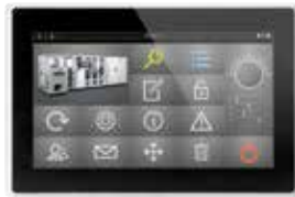
Eaton XH-303 web panel (with HTML5 browser)

The XH300 relies on Linux, a flexible and industry-proven operating system. The Chromium web browser supports HTML5 and loads even complex websites quickly and smoothly, whether it's dashboards from cloud applications or visualizations running on local devices with integrated web server.