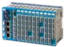
Eaton XC-303 modular PLC (with embedded web server)