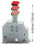
Height-adjustable group marker carrier