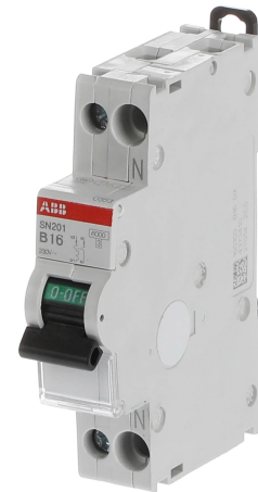
ABB Eco Solutions™

The SN201 MCBs are compact, which makes them well-suited for saving space in the installation. Series 1P+N in 1 module with two different versions with N on the right or on the left according to the different installation habits. Breaking capacity from 3kA to 10kA to cover applications from residential to industrial.