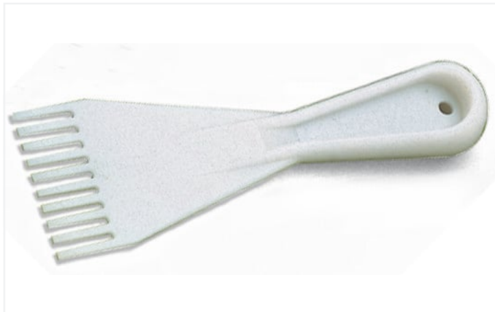
Similar to illustration