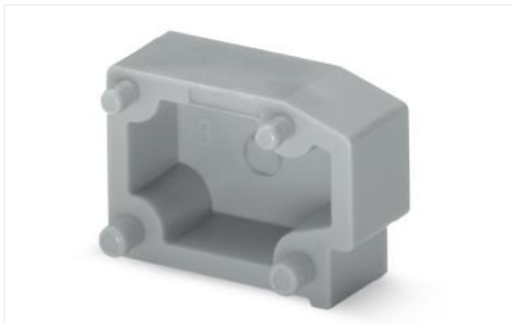
Color: ■ gray