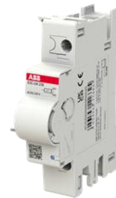
ABB Eco Solutions™

Designed to Protect your equipment from voltage drops with intelligent safety technology that prevents damage and extends equipment lifetime – reducing waste and operational costs. Right-mounted device suitable for MCBs, RCDs, and Switch Disconnectors. Compatible with auxiliary and signaling contacts, Motor Operating Devices (MOD), and Auto-Reclosing units (AR).