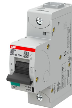
ABB Eco Solutions™

Thanks to an innovative short-circuit extinguishing technology, S800 devices are the ideal solution when both size and performance are key.