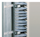
Installation example: Matrix patchboards in a frame