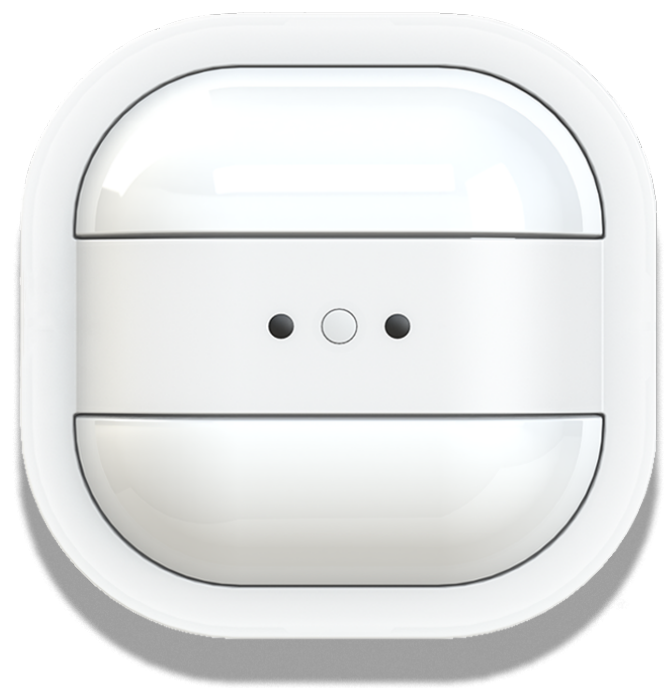
ABB Eco Solutions™

Knowing if people are in or moving around the building is a valuable asset for the efficient automation of any property. The ABB i-bus® KNX range of innovative motion and presence detectors helps to control and manage daily tasks in throughout a building. Whether lighting, heating, air-conditioning or security related functions, this portfolio of premium design, high quality detectors can significantly improve levels of safety, efficiency and comfort throughout the building.