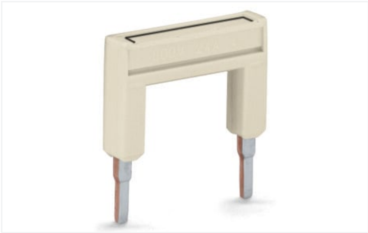
Color: ■ light gray Similar to illustration