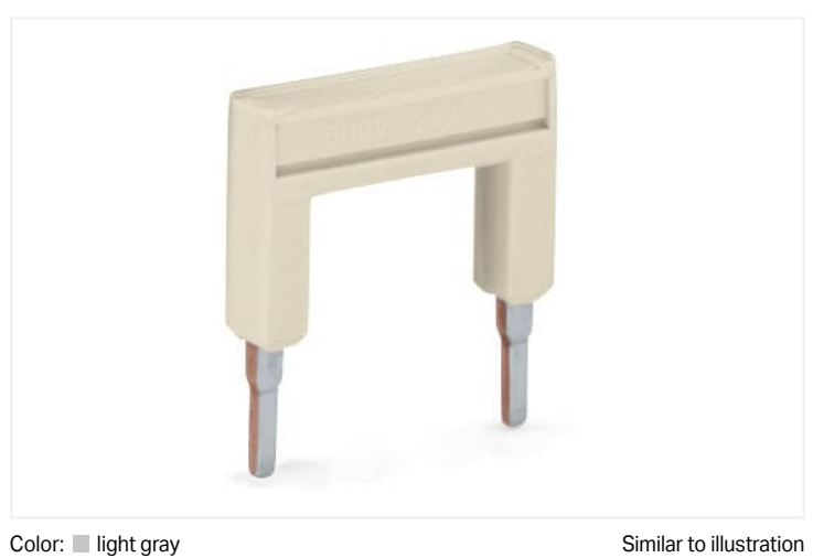
Color: ■ light gray