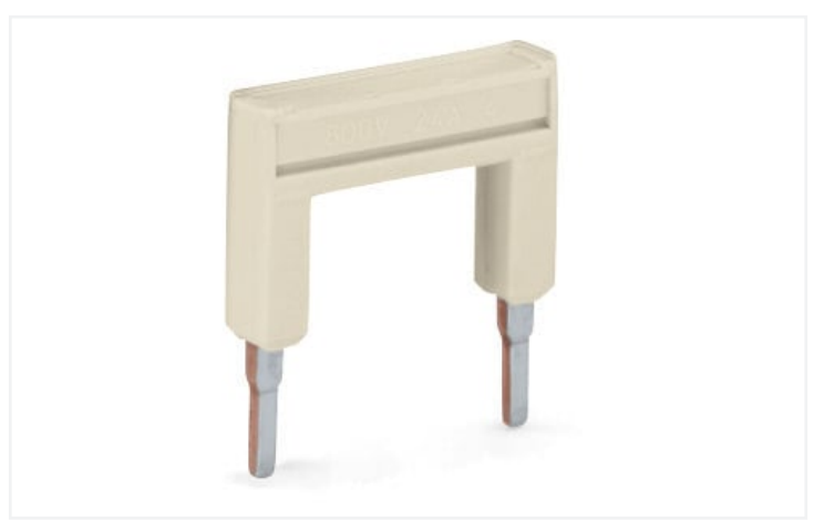
Color: ■ light gray Similar to illustration