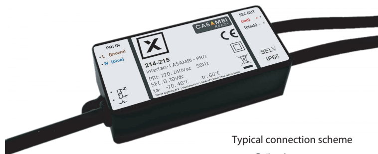
Typical connection scheme

Interface with CASAMBI lighting control, configurable, with IP protection