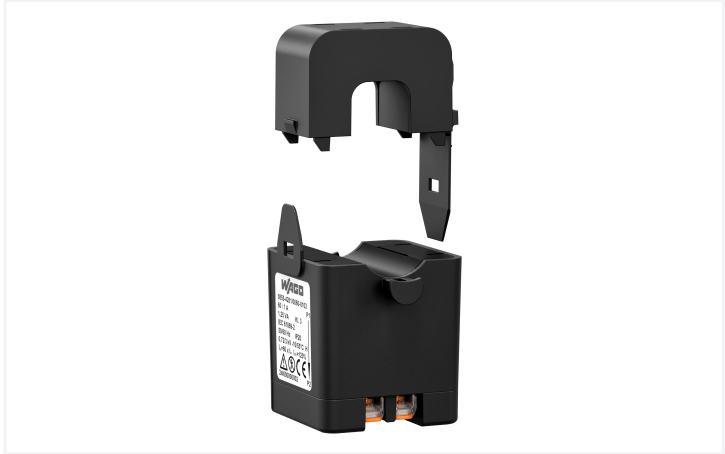
Similar to illustration