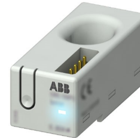
ABB Eco Solutions™

Each sensor is equipped with a microprocessor to process signals and transmit data digitally to the control unit via the bus interface. This reduces cabling needs, enhances transmission reliability, and eliminates common issues associated with analog data. Closed-core current sensors are optimal in new installations for higher accuracy.